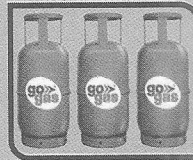
Packed Cylinder Marketing